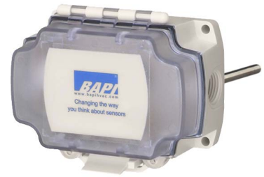
Wireless Immersion Temperature Transmitter

BAPI Wireless Immersion Units are available in 2", 4" and 8" probe lengths. The sensor is potted inside a 1/4" stainless steel probe with thermally conductive epoxy. The Immersion Units come with etched teflon leadwires, double encapsulated sensors and a watertight BAPI-Box enclosure to withstand high humidity and condensation and perform under real world conditions.